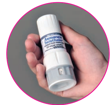
This is the ASMANEX® TWISTHALER®