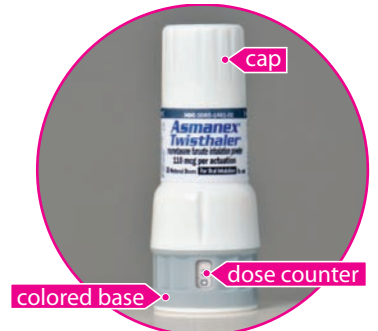
Become familiar with the parts of the inhaler